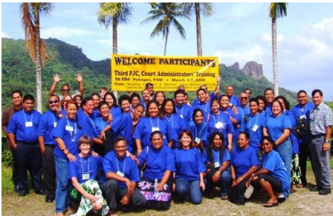
3rd Annual PJC Conference participants

The 3rd Annual Pacific Judicial Council's Court Administrators Conference was held March 4-7, 2008 at the Pacific Missionary Aviation Auditorium in Kolonia, Pohnpei. The con-